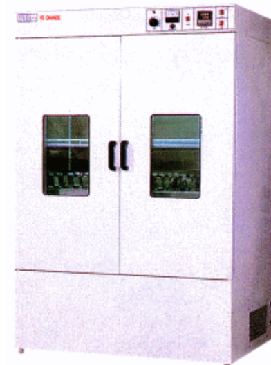
* YC-7940 Ambient 60°C * YC-7940A 0°C to 60°C